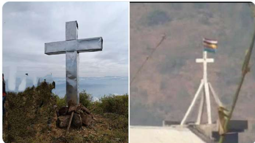
1:25 PM · Dec 1, 2023 · 4,601 Views

Stand alone cross is a Threat But destroying church & flying salai taret is fine?