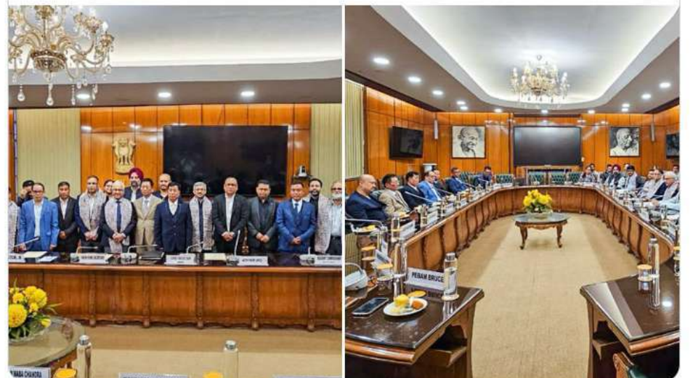
7:15 PM · Nov 29, 2023 · 5,547 Views