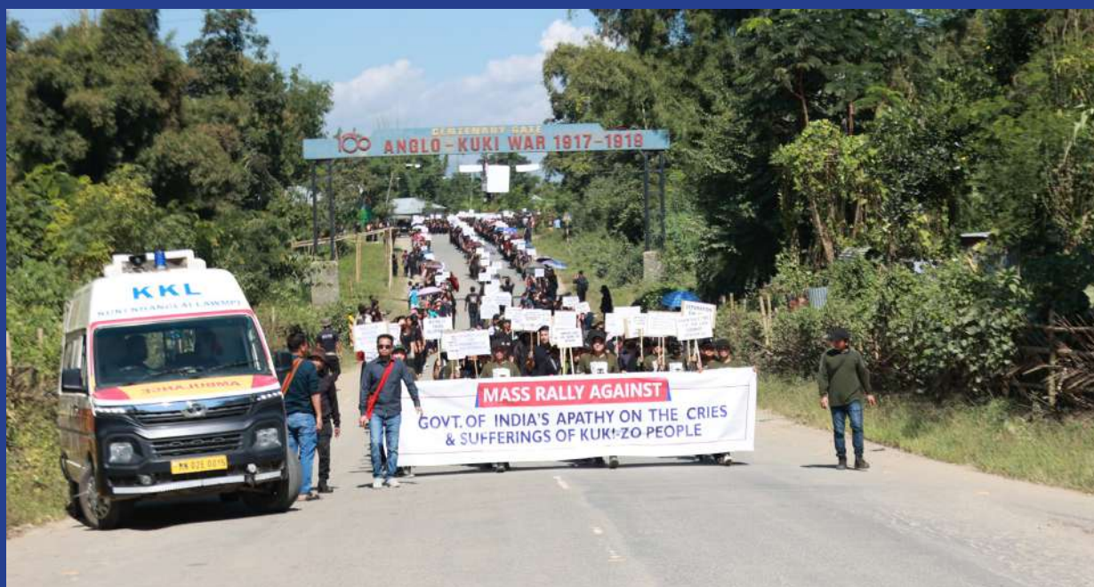
Thousands of young and old Kuki-Zo people from different walks of life on Friday took to the streets for a mass peaceful rally in Churachandpur district "against the gross human rights violations on the Kuki-Zo people".