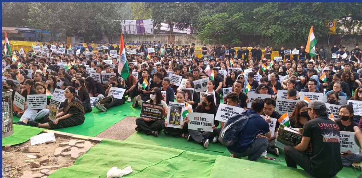
Sit-in Protest at Jantar Mantar, New Delhi jointly organised by Joint Unau Delhi Tribal Students' Forum, Delhi; Kuki-Zo Women's Forum, Delhi; and Unau Tribal Women's Forum, Delhi