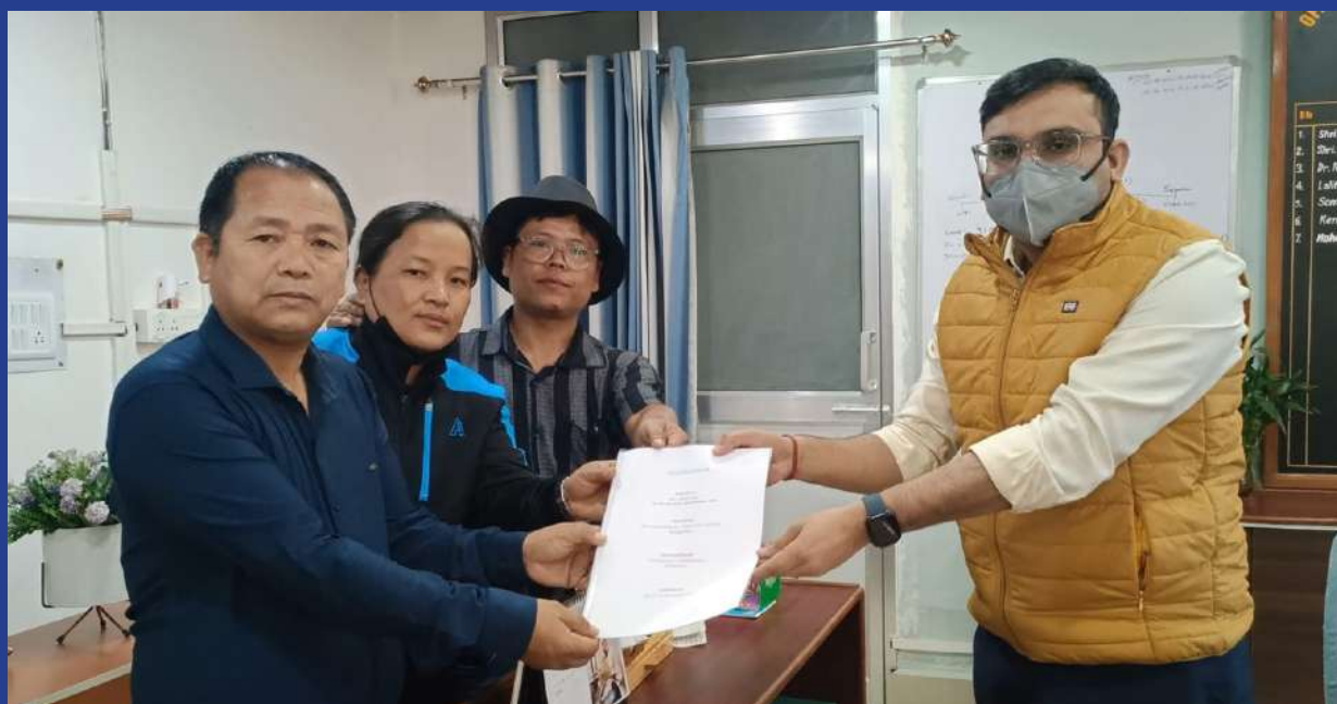
The Committee on Tribal Unity, or CoTU, Sadar Hills Kangpokpi district apprised the Union Home Minister through a representation submitted through Deputy Commissioner Kangpokpi on Moreh issue on the second day of its total shutdown today.