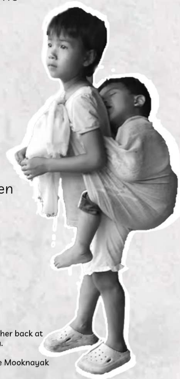
A girl carrying her brother on her back at Rengkai Relief Camp in Lamka.