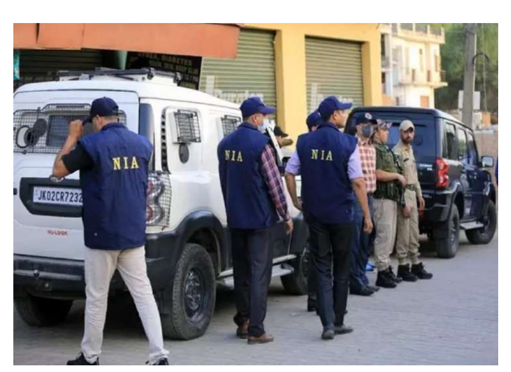
Representational image: The Economic Times

According to the NIA, it was revealed during the field investigation that five accused persons having links with terror outfits operating in Manipur were arrested by the Manipur State Police and that accused Moirangthem