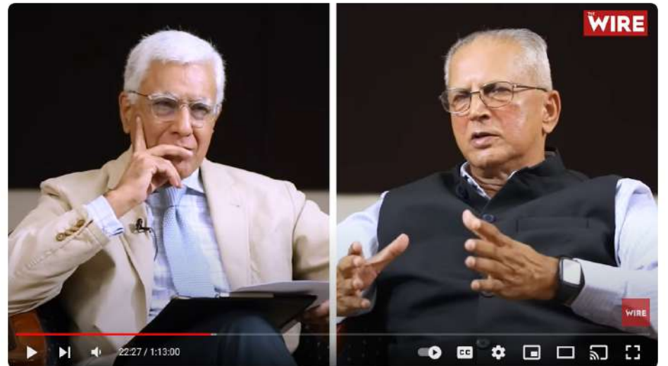
BJP Govt Siding With Meitei against Kuki; Modi Was Wrong Not to Reach Out and Heal: Gopal Pillai

If one looks at history, the British found Kukis to be a great ally due to their great martial traits and thus used them as buffers from Burmese Kingdom stretching from Chittagong Hill Tracts in the South to Sagaing in the North with the many Kuki Levies formed. However, after the fall of Burma in 1885, the British started planning to take back most of the guns that the Kukis accumulated. They also started interfering in Kuki way of life, which along with other factors, led Kukis to fight the British for three years famously known as the Kuki-Uprising 1917-1919. Though Kukis were subdued in this Anglo-Kuki War (1917-1919), when the Japanese Imperial Army along with the Indian National Army marched to India through Burma in the 1940s, it was our Kuki people who greatly helped them as a result of which they marched till India with great Initial successes. If we look at history, waves of attacks