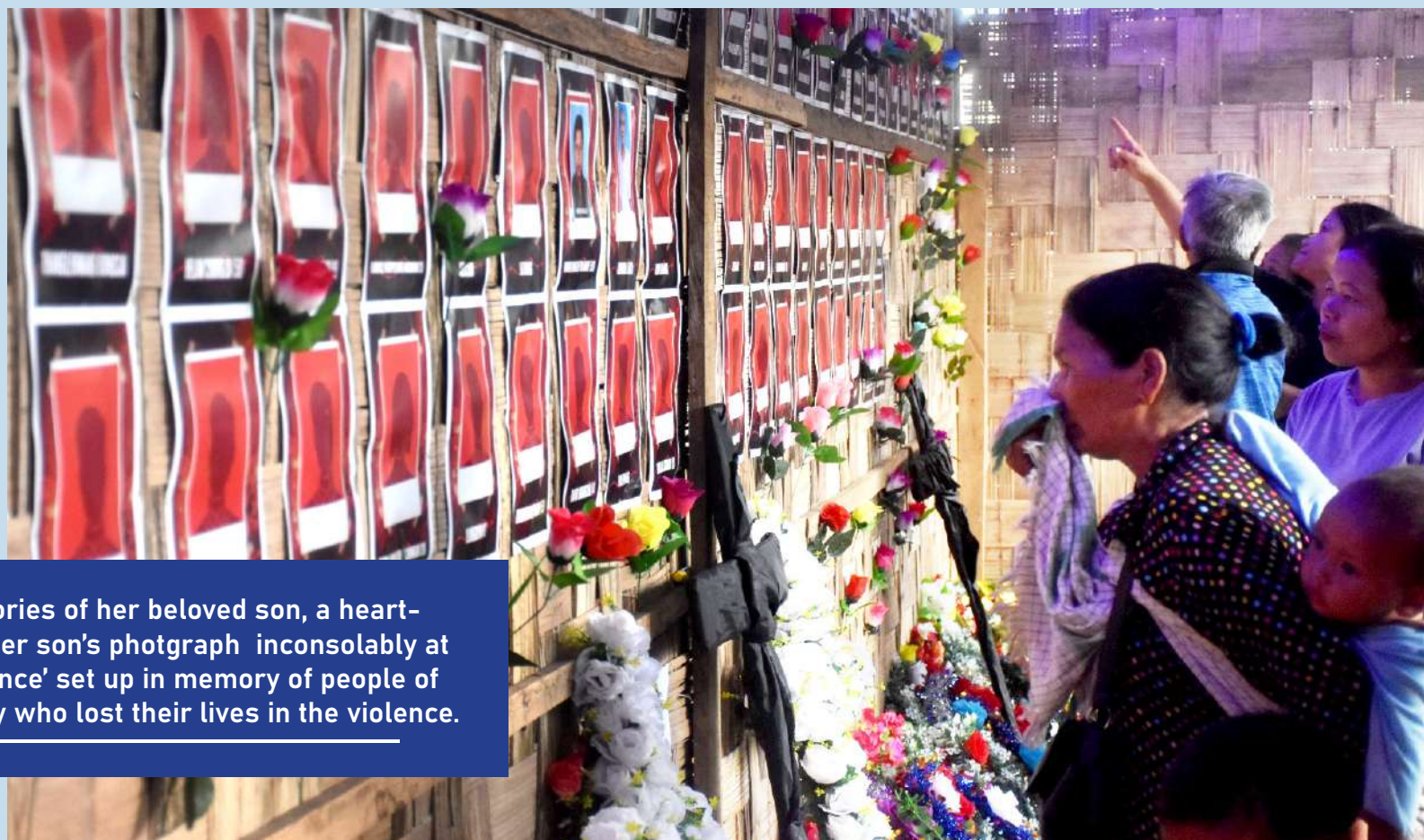
Shattered by the memories of her beloved son, a heart-broken Mom looks at her son's photograph inconsolably at the 'Wall of Remembrance' set up in memory of people of the Kuki-Zo community who lost their lives in the violence.