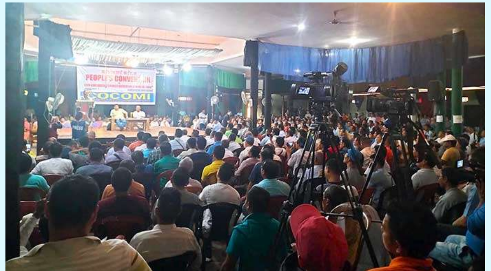
A convention by the so-called COCOMI, which declared war against the Kukis

In the wake of the digital era, the emergence of social media platforms, encompassing their pages, groups, and communities, has inadvertently given rise to an unofficial civil society. Within this virtual realm, the initial glimpses of discord and animosity towards a particular community first became discernible. Despite the potential for intervention, the government, led by Chief Minister N Biren Singh, missed the opportunity to curb this trend