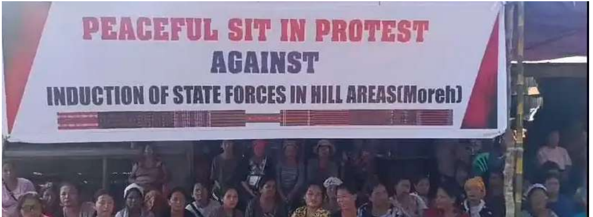
Sit-in-Protest at Moreh town under the aegis of Kuki Inpi Tegnoupal

The people of Tegnoupal district have come out in large numbers against the induction of state forces in the Hill Areas by staging a sit-in-protest at Moreh town, today. The sit-in was held under the aegis of Kuki Inpi Tegnoupal (KIT).