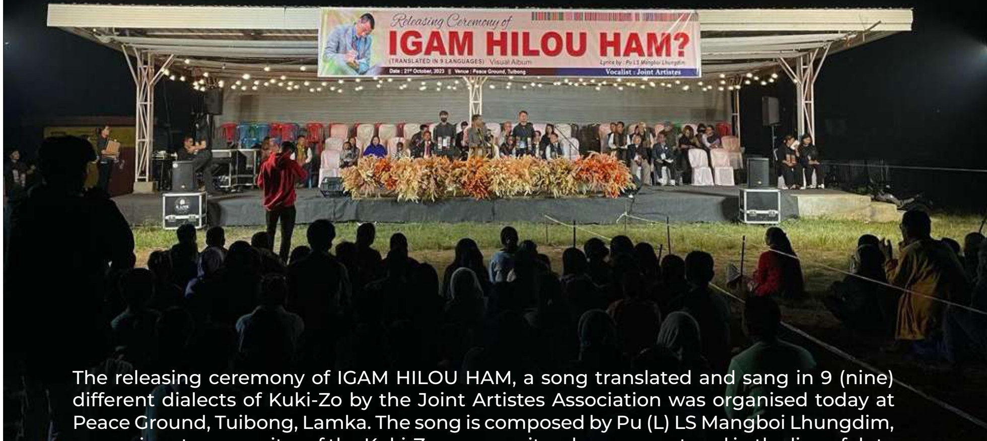
The releasing ceremony of IGAM HILOU HAM, a song translated and sang in 9 (nine) different dialects of Kuki-Zo by the Joint Artistes Association was organised today at Peace Ground, Tuibong, Lamka. The song is composed by Pu (L) LS Mangboi Lhungdim, a prominent song-writer of the Kuki-Zo community who was martyred in the line of duty as a volunteer defending kuki-Zo villages on 31st August 2023.