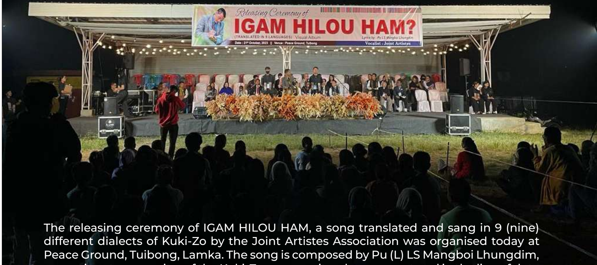
The releasing ceremony of IGAM HILOU HAM, a song translated and sang in 9 (nine) different dialects of Kuki-Zo by the Joint Artistes Association was organised today at Peace Ground, Tuibong, Lamka. The song is composed by Pu (L) LS Mangboi Lhungdim, a prominent song-writer of the Kuki-Zo community who was martyred in the line of duty as a volunteer defending kuki-Zo villages on 31st August 2023.