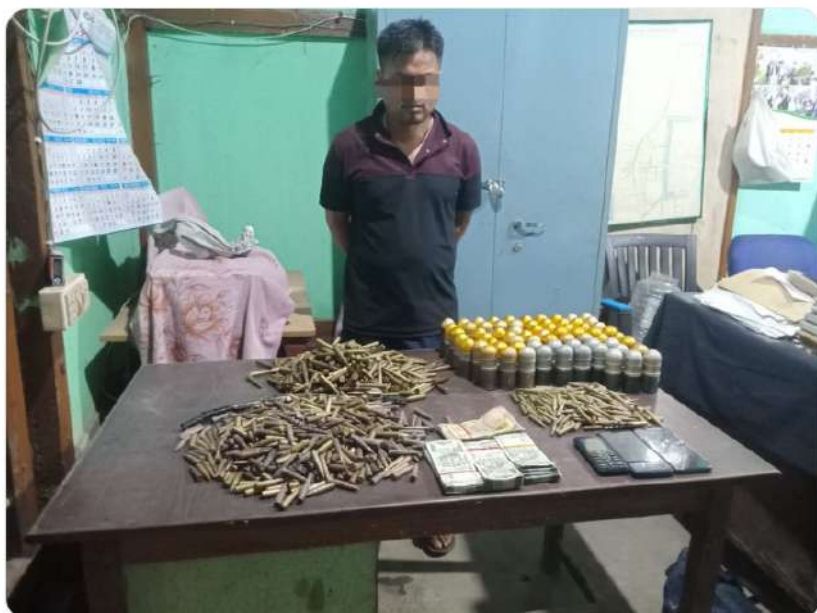
10:45 PM · Oct 22, 2023 · 15.4K Views

On 21.10.2023, Manipur Police detained 01 (one) active member of an underground group from Imphal-West District and recovered the following ammunitions and explosives: (i)68 (sixty-eight) nos. of live round of 40 mm Lathode Ammunition (UBGL). (ii)573 (five hundreds seventy-three) nos. of 7.62 live round Ammunition (iii)294 (two hundreds ninety-four) nos. of 5.56 live round Ammunition. (iv)379 (three hundreds seventy-nine) nos. of 7.62 live round Ammunition. The accused person along with the seized items were handed over to the Imphal West District Police and later remanded into police custody.