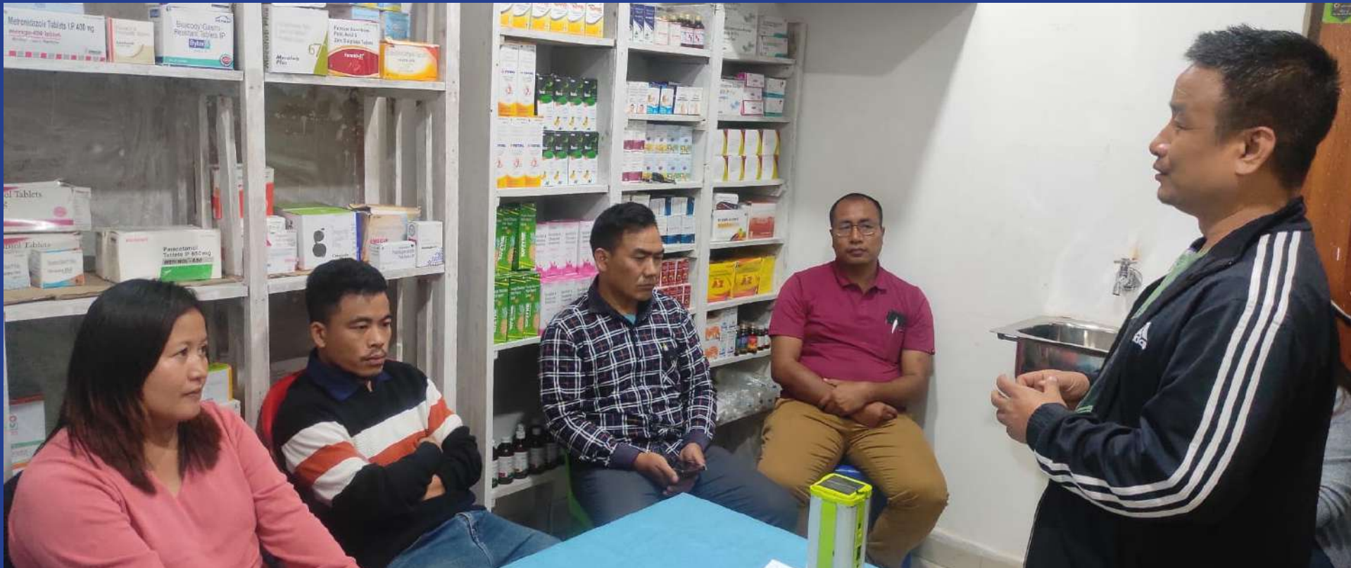
The Kuki Khanglai Lawmpi (KKL-GHQ) in their endeavor to ease the financial burden of the IDPs who have faced immense financial difficulties in availing medicinal items, have opened a Pharmacy – exclusively for the Internally Displaced Persons (IDPs) at KKL Complex, IB Road, Lamka.