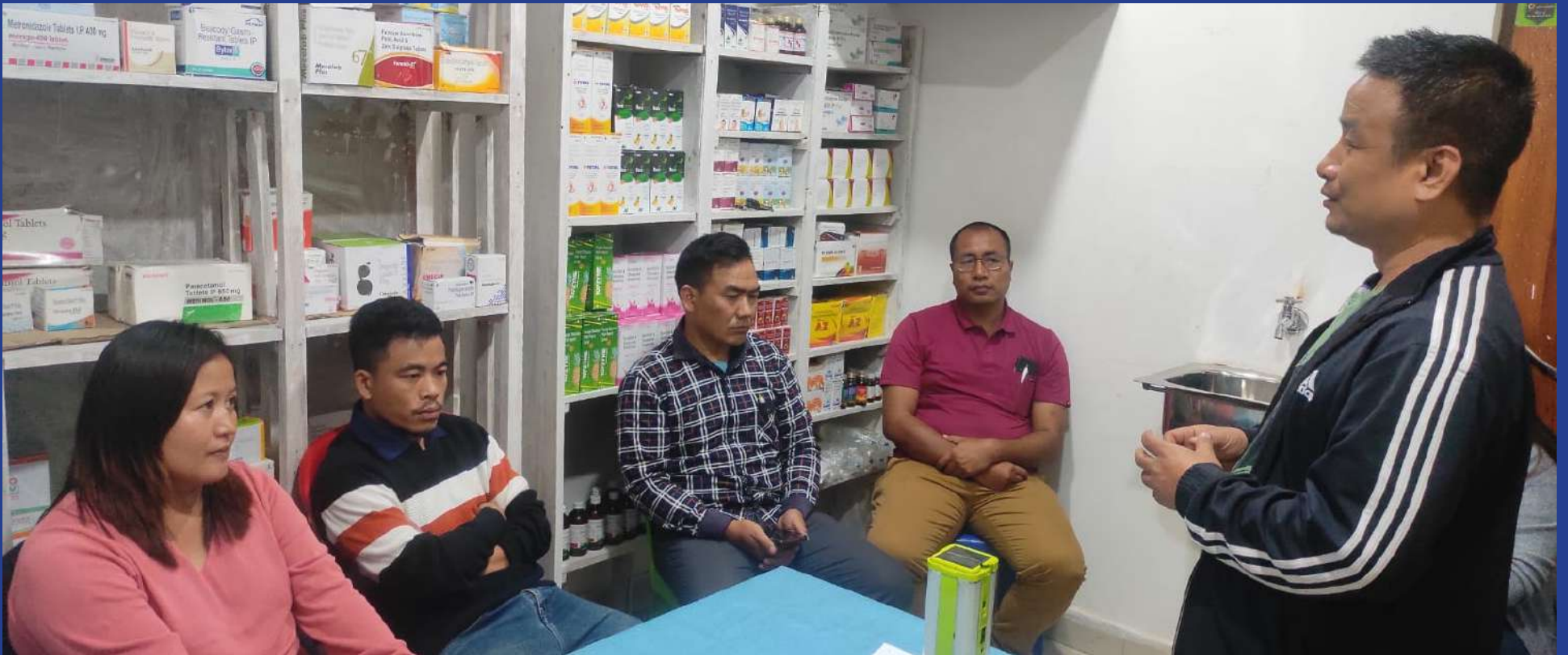
The Kuki Khanglai Lawmpi (KKL-GHQ) in their endeavor to ease the financial burden of the IDPs who have faced immense financial difficulties in availing medicinal items, have opened a Pharmacy – exclusively for the Internally Displaced Persons (IDPs) at KKL Complex, IB Road, Lamka.