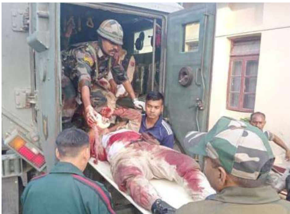
continue the same till the culprits are arrested.

The Cabinet also noted that additional State forces have been detailed from Imphal for the purpose and the operations have since started. The Cabinet further directed that the Central and State forces shall ensure free movement of transportation and general public along Pallen-Moreh road on NH-102.