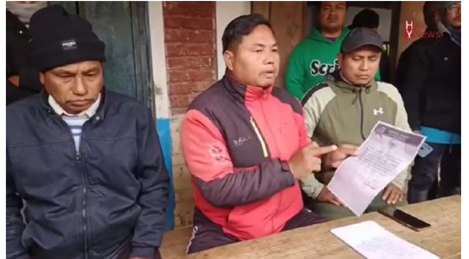
Press briefing by JAC

“You guys are doing anything whatever you want. There is law. If any dispute arises, inform the concerned authority. There is government, we will solve the issue