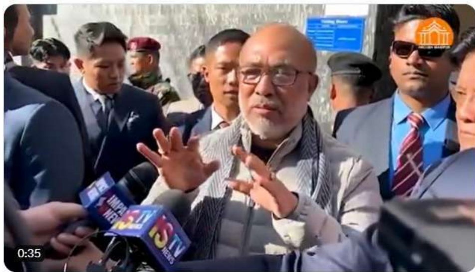
7:57 PM · Jan 2, 2024 · 1,296 Views