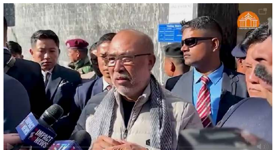
Manipur CM N Biren Singh at a press briefing today

amicably. You all are responsible for disturbing peace in the valley and if AFSPA is re-imposed again in the valley, you all will be held responsible,” he said.