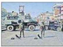
Manipur has been gripped by violence since May last year.