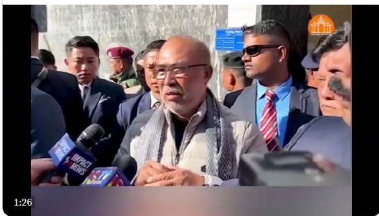
9:35 PM · Jan 3, 2024 · 283 Views