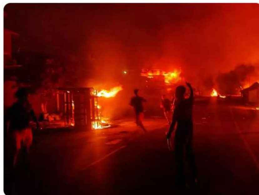
8:48 PM · May 3, 2024 · 416.6K Views