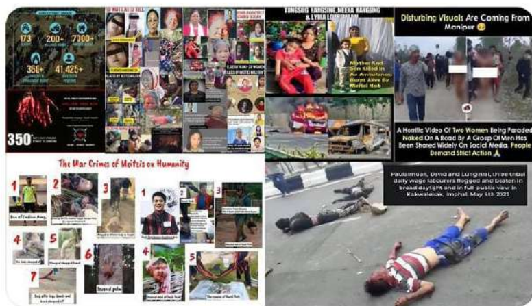
Ministry of Tribal Affairs, Govt. of India and 9 others

1year of Ethnic Cleansing against #Kuki_Zo by #Meiteis Before #Manipur_Violence Started Meitei goons have already stated counter blocked against Tribal Peace Rally at Torbung! This is how they are provoking #KukiZoTribals They want a war & thy hv succeeded! #KukiZoAwakeningDay