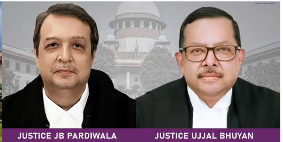
JUSTICE JB PARDIWALA