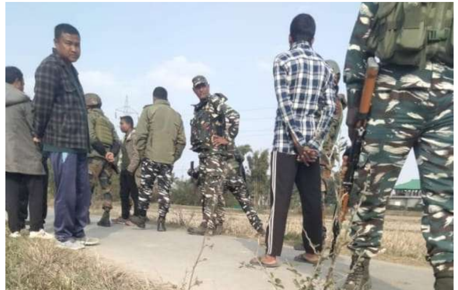
Pic: Officials and security personnel denied entry by Meira Paibis and locals

During the course of their ongoing ethnic cleansing campaign against the Kukis and the preceding events, the Meiteis' propensity to rely and bank on manufactured fear and fabricated apprehension are