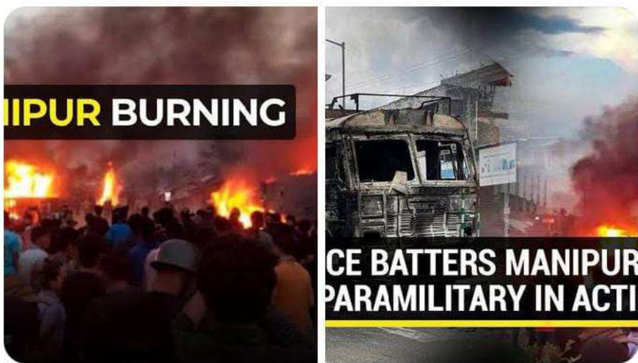
9:24 pm · 04 Mar 24 · 45 Views

#Manipur, you voted BJP back to power. And yet he doesn't consider you as part of #ModiJiKaParivaar! Wonder why 🤔