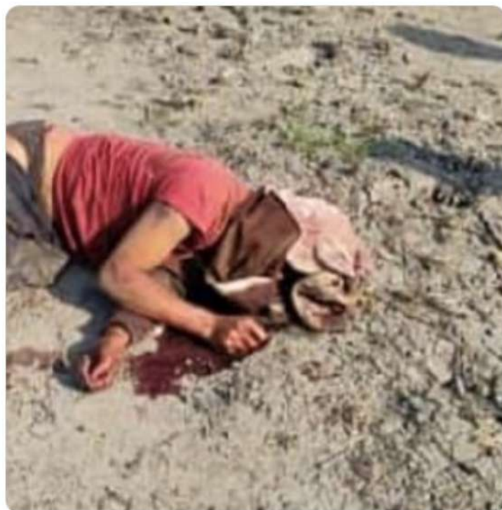
7:37 AM · Jan 5, 2024 · 4,586 Views

Manipur, India: A fresh wave of attacks have been unleashed against indigenous Christians. Over Christmas and New Years, homes were torched and families displaced. Some were even killed. All this follows months of religious and ethnic violence targeting the Kuki community.