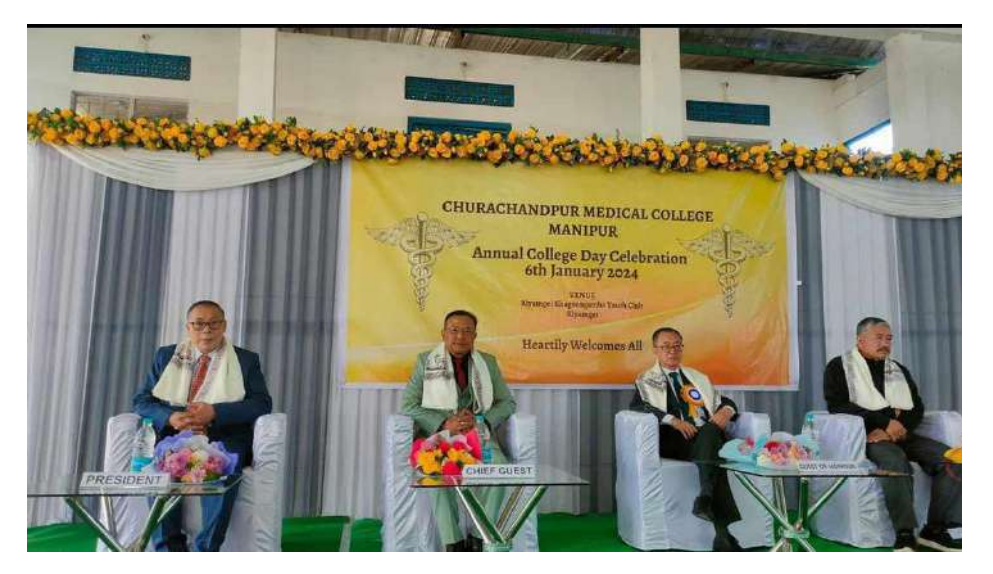
Pic: Foundation Day Celebration of Churachandpur Medical College in Imphal

While JSB, Lamka has fought long and hard to prevent the relocation of the Medical College and for the proper functioning of the Medical College,