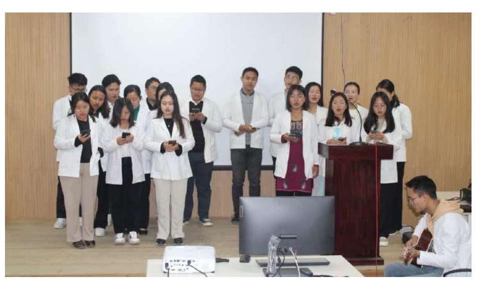
Pic: Foundation Day Celebration of Churachandpur Medical College at Lamka

in particular, at this time of civil war and displacement of medical students, the annual day celebration in Imphal is viewed as nothing short of an insult to the people of the district, it added.