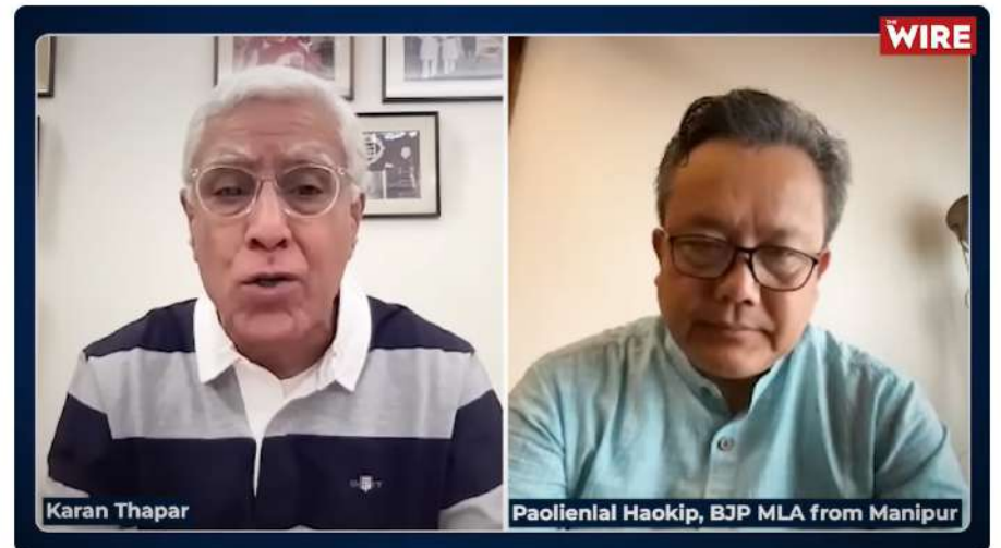
'Arambai Tenggol is Biren Singh's Creation to Threaten Centre; Today It's More Important Than Govt'