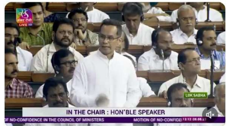
11:58 · 08 Aug 24 · 21.8K Views