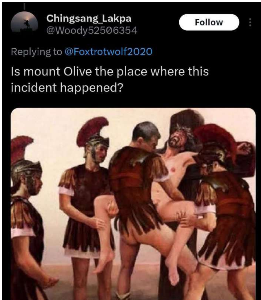
Pic: A Screenshot from a Meitei Twitter/X handle

Supreme Court of India. Were you not complicit? Had you pressured the state government that indulged and protected these criminals to take appropriate actions, they wouldn't have had the courage to break laws that forbid such insane and inhumane acts. Is it not?