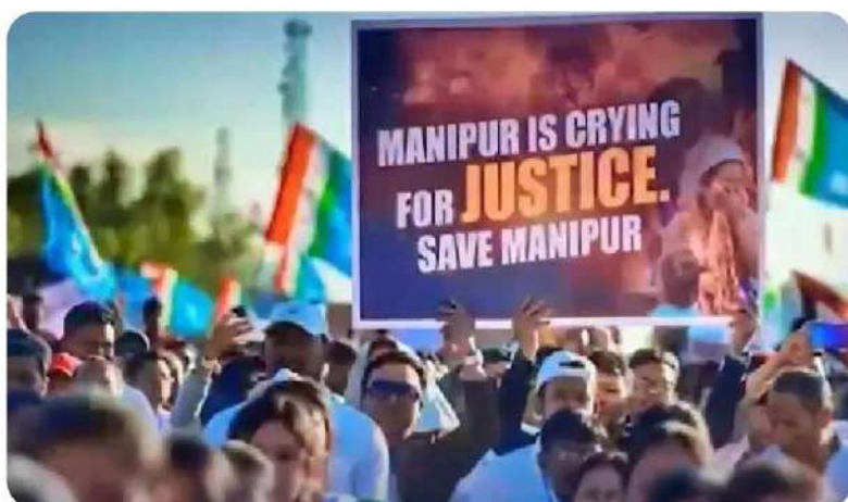
17:14 · 09 Aug 24 · 46 Views

UN slams India over Manipur crisis. Grave concerns raised about ethnic cleansing, religious persecution & human rights violations. Global body demands immediate action to stop the bloodshed & protect innocent lives. #ManipurViolence #India #UNReport #HumanRights