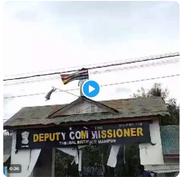
14:08 · 09 Sept 24 · 1,147 Views

In Thoubal District of Manipur, the Indian flag was replaced by the Meitei flag. I believe no community should be blamed for this act of disrespect, those responsible must be held accountable and punished. This brings us to a larger question of accountability: despite hundreds of FIRs being filed over the past 1.5 years, how many cases have actually been resolved by the State or Central Government?