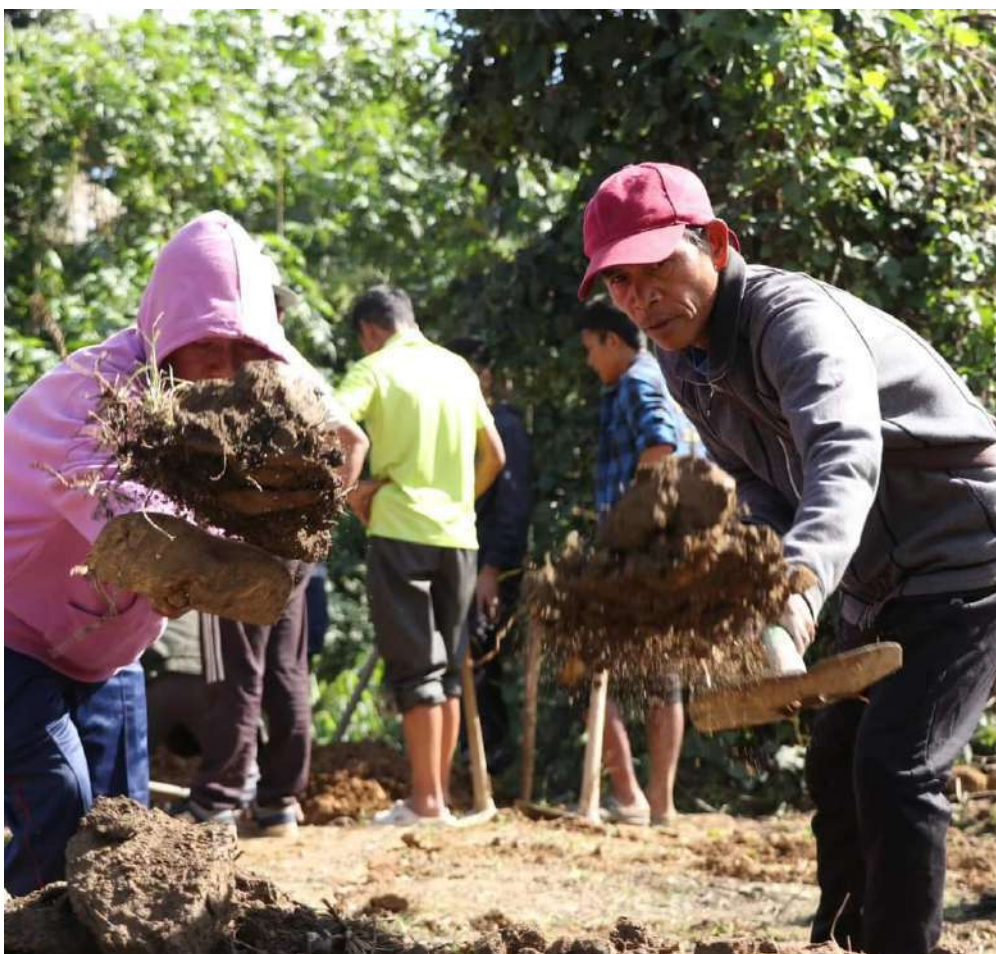
Pic: Skill training on organic farming

Two days skill training on organic Nutrition Garden was conducted for 50 Participants which includes 40 IDPs Inmates with 4 Staff and 6 Community First Contact Care .The main objective is to encourage the IDP Inmates to take up organic nutrition garden in the backyard of