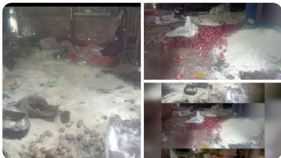
Maktoob and 9 others