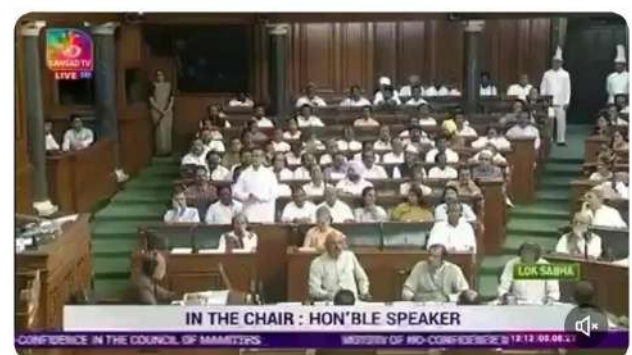
14:46 · 09 Aug 24 · 1,344 Views