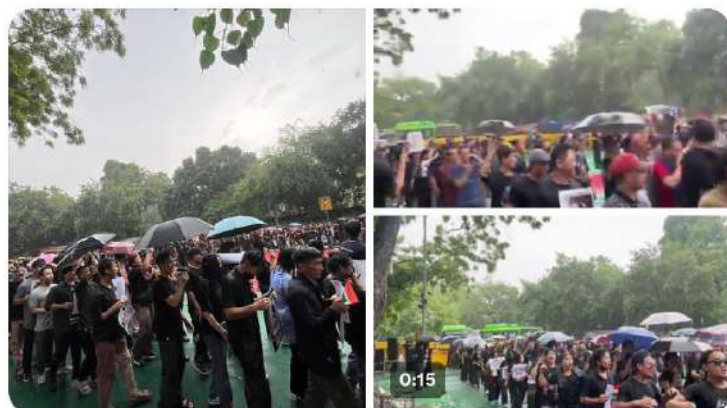
17:09 · 10 Aug 24 · 309 Views

Granting #UnionTerritory4KukiZo is the only solution to protect their future. Govt must expedite process of separation and offer political solution at the earliest.