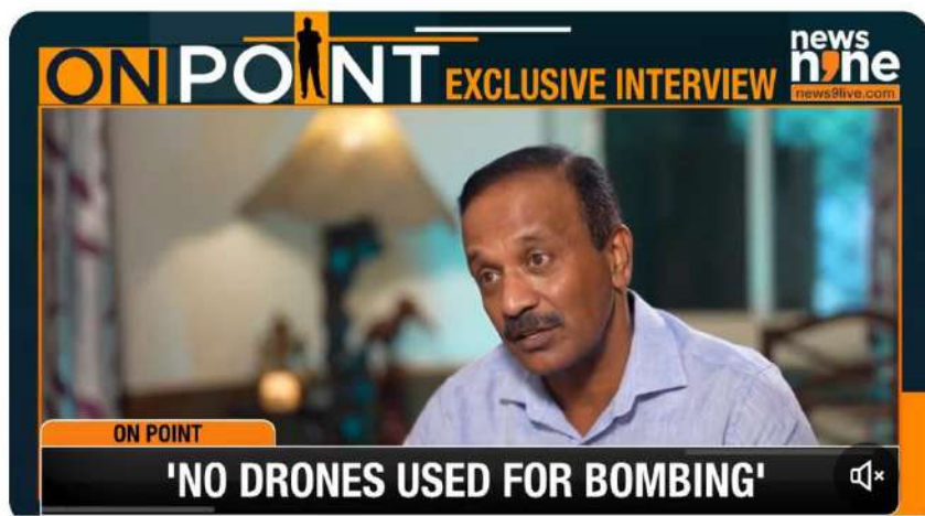
20:38 · 09 Sept 24 · 31.7K Views

@kartikya_1975 #ManipurViolence #ManipurConflict #droneattacks