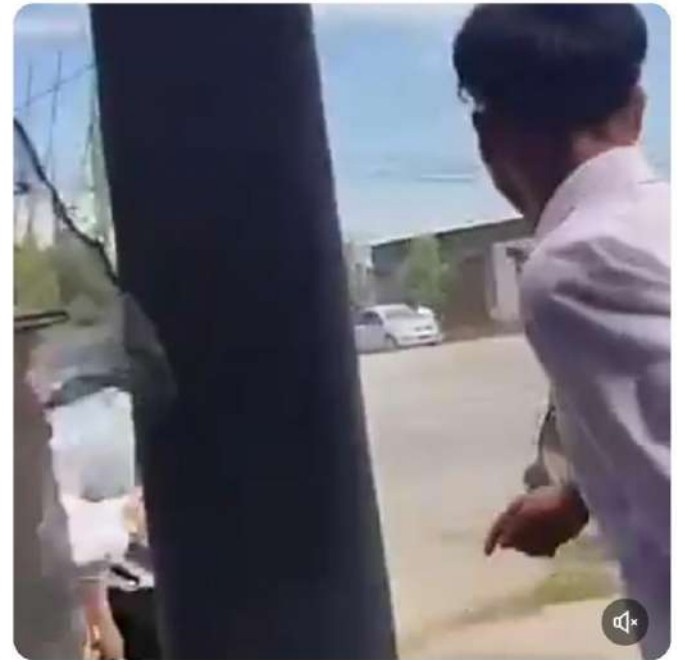
14:46 · 10 Sept 24 · 869 Views

KUKI WOMAN KILLED BY MEITEI'S BOMB BLAST