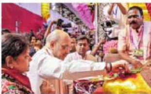
Home Minister Amit Shah offers prayers at 'Lalbagh Raja' in Mumbai [en

AMID mounting tension over seat-sharing in the BJP-led Mahayuti in post-bound Maharashtra, senior BJP leader Amit Shah on Monday held a closed-door meeting with the alliance partners, emphasising the crucial role of unity for its success in the assembly polls and cautioning them against airing their internal differences in public.