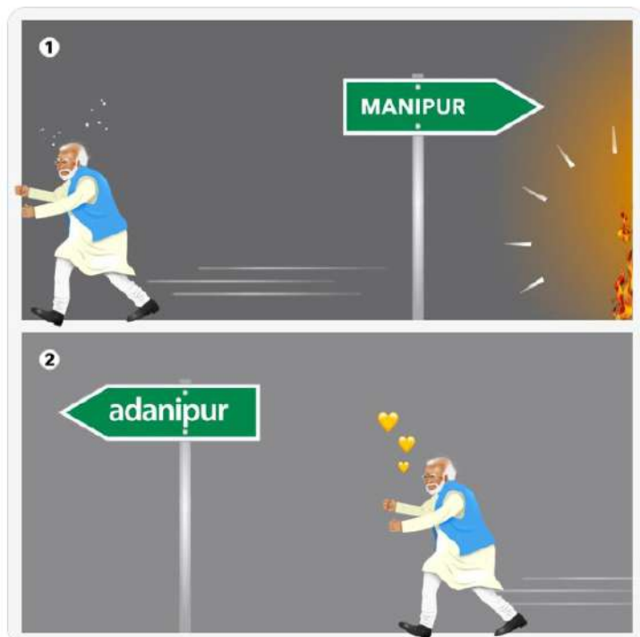
1:18 PM · Jan 12, 2024 · 89K Views

PM मोदी की प्राथमिकता Translated from Hindi by Google PM Modi's priority