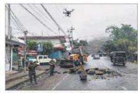
The state has been in the throes of conflict for over 10 months.