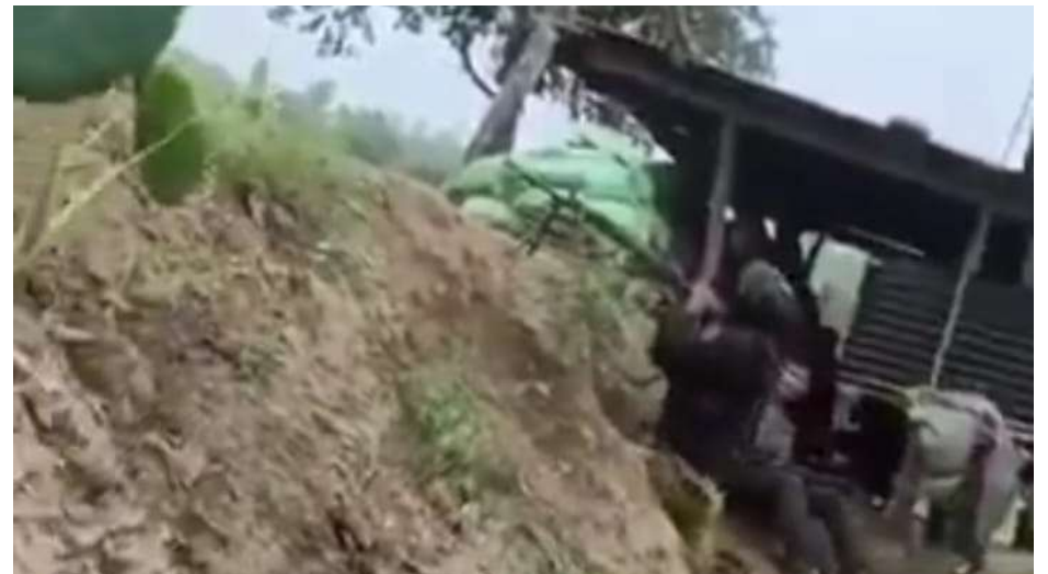
Village of Maphou, Kanggui district, adjoining the Meitei locality of Moirangpurel, Imphal East.

Today, during the Kuki village guards’ routine Operational Patrolling (R.O.P.) duty within their ancestral land, the Kuki-Zo Village Volunteers were encountered heavily with gunfire using sophisticated weaponry by the Meitei militants attempting to breach the hills by crossing the buffer zone. Positioned at Kamu Saichang, the combined forces of Meitei militants and Arambai Tenggol, along with the Meitei Police commandos, launched fresh assaults on the Kuki-Zo