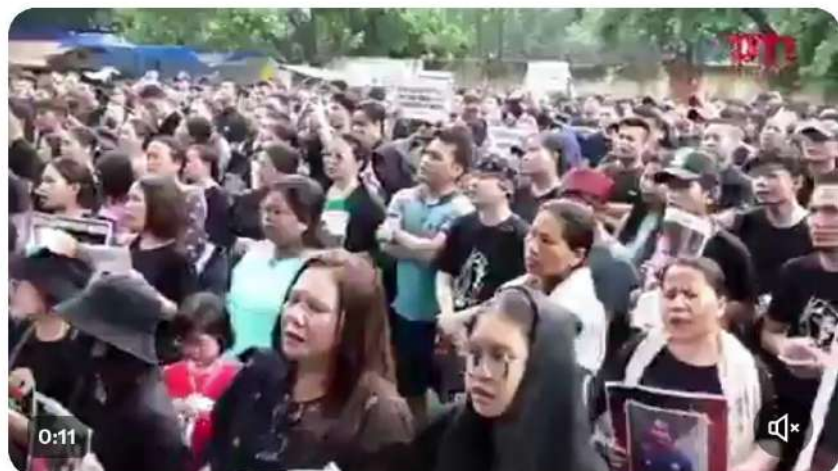
14:26 · 12 Aug 24 · 1,214 Views

#Kuki students hold protest in #Delhi demanding separate administration in #Manipur. #Olympics2024Paris #Kanguva