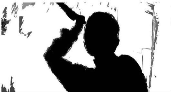
eastmojo.com Manipur: Police personnel assaulted; tribal body declares shutdown

The armed men accused the policemen of supporting Kukis and subjected them to various forms of torture.