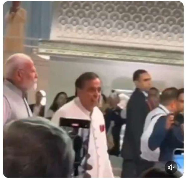
21:55 · 13 Jul 24 · 606 Views

PM Narendra Modi ji have time to visit #AnantRadhika Marriage at Jio Centre in Mumbai! But he not visit to Manipur state! North East State Very Important for Us!