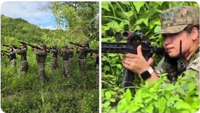
16:28 · 13 Jul 24 · 793 Views

Will @HMOIndia @PMOIndia @DefenceMinIndia keep quiet on this anti-National elements and compromise national security? @Spearcorps @adgpi