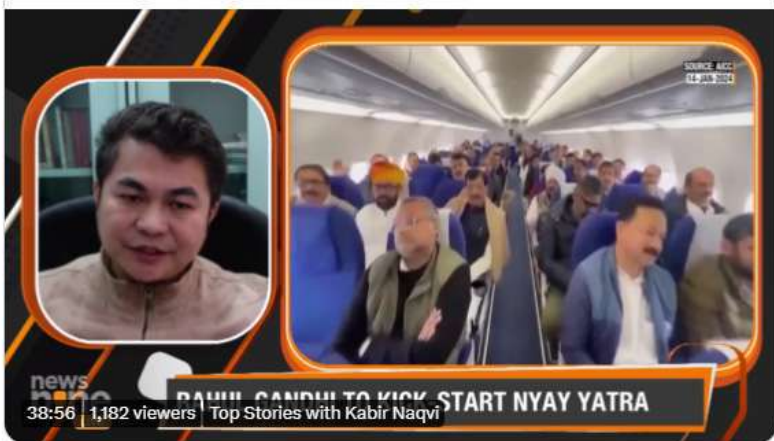
1:57 PM · Jan 14, 2024 · 2,488 Views

@kabir_naqvi @ramindesai @BhagatOinam @th_robert @majoramitbansal... Show more