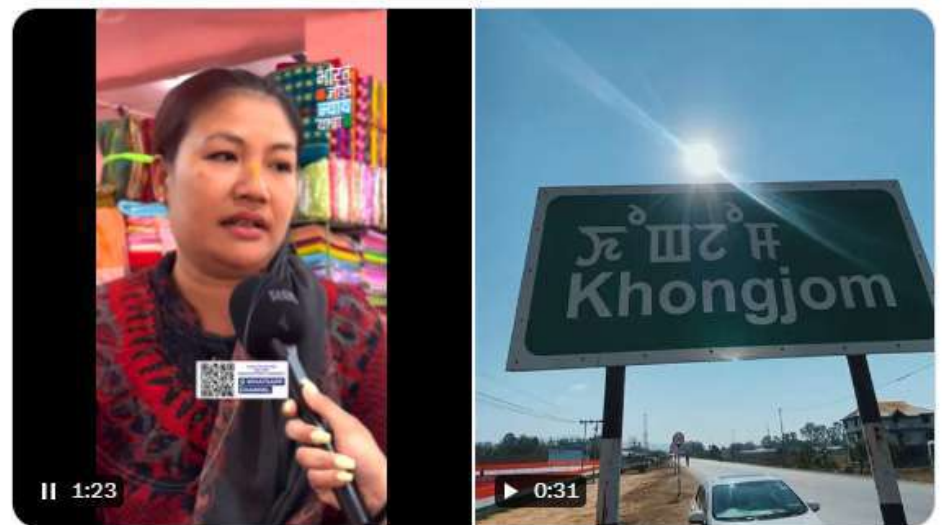
11:53 PM · Jan 13, 2024 · 9,158 Views