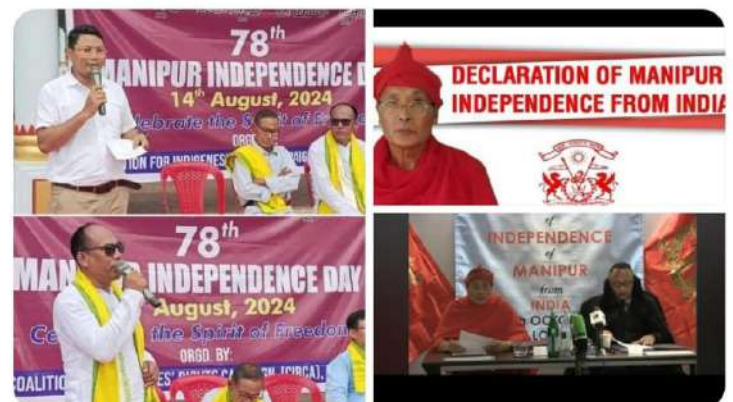
13:31 · 14 Aug 24 · 32 Views

The point is how much longer will the central government remain passive in the face of these #Secessionist and #Separatist movements? #Kanguva #LCDLFX2 #KanguvaTrailer