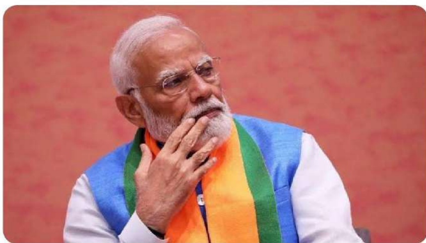
11:37 · 13 Aug 24 · 2,389 Views

They ruling BJP is not bothered for the people are being paraded naked and murdered in Manipur for the past 18 months , but they are more concerned of spreading false propaganda through their Godi Media channels of Hindu's living in Bangladesh .