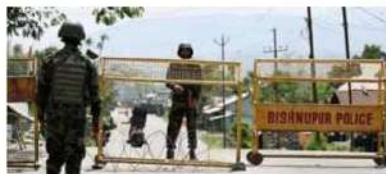
Tight security arrangement made on the highway between violence-hit Churachandpur and Bishnupur.