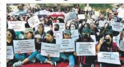
Protesters hold placards during a demonstration in Delhi.

Security officials on the ground said there are multiple reasons such as financial losses, unemployment, need for money to buy weapons or run operations, and abundance of arms and ammunition among civilian population, behind the rise in