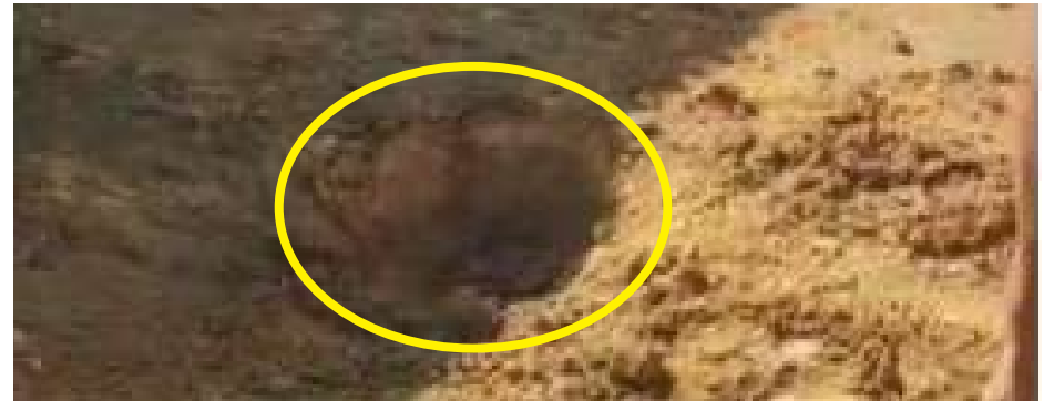
Pic: Spot where bomb was dropped

The incident brings back to light the 3-day drone training program conducted by the Directorate of Rural Development and Panchayati Raj at the Luwangpokpi Cricket Stadium in Imphal East between 7-9 August 2023, wherein a participant had leaked that 'anyone' interested could join the training. That training had raised a red-flag among the Kuki community who suspected that the training conducted under the aegis of a state department was only a cover-up wherein Meitei radicals were trained in the use of drones to be used against the Kukis and that the state had used the occasion to provide drones to its radicals. The suspicions have now been seemingly revealed to be true.