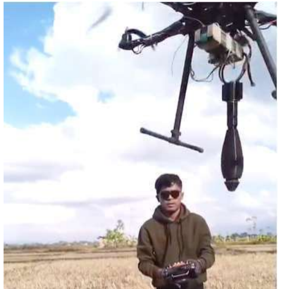
Pic: Screenshot from a viral video of a Meitei man with his carrier drone with dummy bomb

The use of drones for dropping bombs adds a new dimension to the war which is now in its eight month. Such drones could be used for much more accurate targeting of civilians as it is very well known that Meitei drones have been hovering over the hills and surveying bunkers and clusters of people. The Centre government and central security forces must take this threat seriously as it poses a danger not only to the Kukis but also the security forces as well, with the wave of Meitei secessionist militancy once again on the rise in this fragile border state of India.