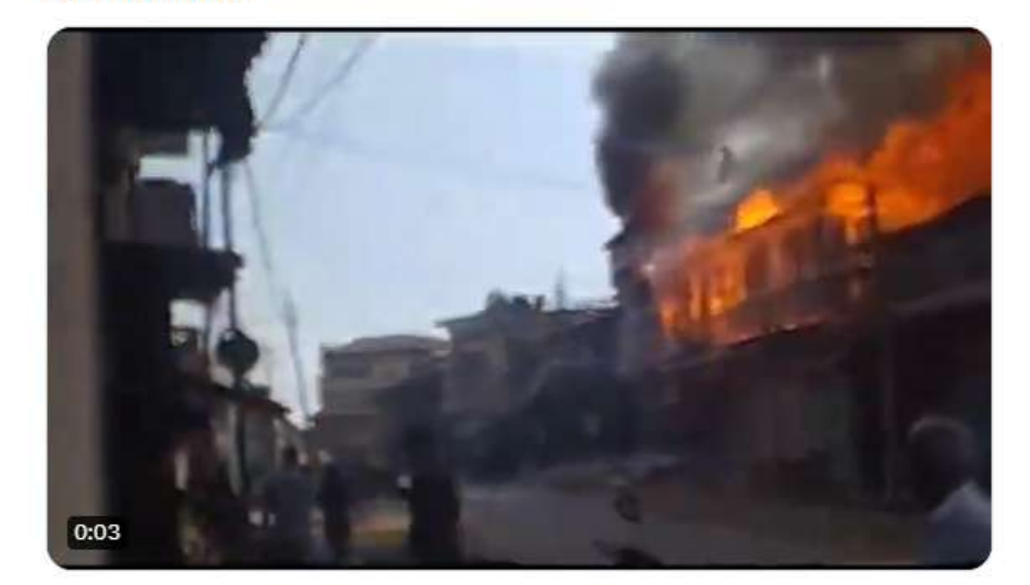
6:44 PM · Jan 17, 2024 · 1,074 Views

I would request all our chin and Mizo brothers to join to save our clan from Annihilation by Arambai tengol.State ,country ,borders doesn't matter over the blood over of your kins. It's a humble request and a clarion call for survival. #SaveMorehHillTown #Manipur #ChinKukiMizo