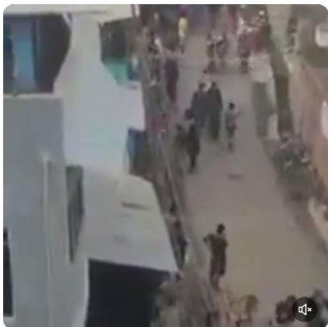
9:44 pm · 17 Apr 24 · 352 Views

#EndMeiteiThieves #MeiteiWarCrimes #ManipurViolence