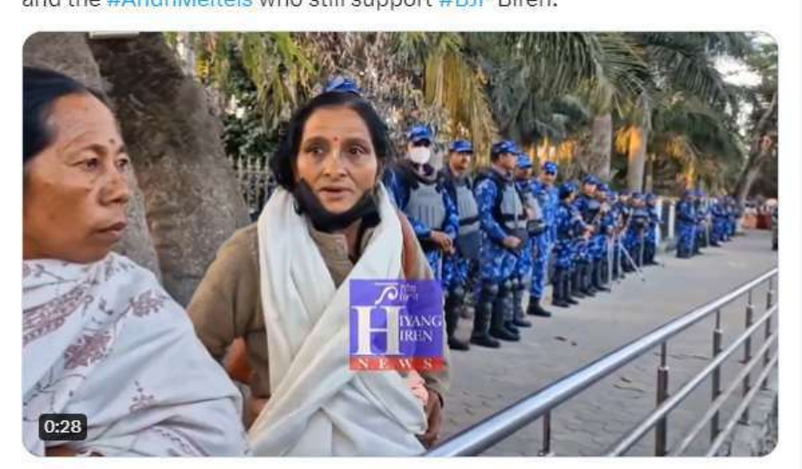
9:28 AM · Jan 18, 2024 · 3,822 Views

#ManipurViolence Something which both the #Kuki_Zo and #Meiteis in #Manipur can agree on - The utter and complete failure of #BJP for 9 months straight of continuous violence since 3rd May 2023, except for the #AndhBhakts and the #AndhMeiteis who still support #BJP Biren.