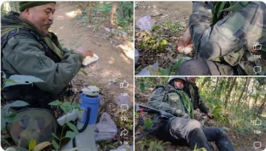
10:42 AM · Jan 19, 2024 · 2,047 Views

So these are the meiteis so-called Farmers , woodcutter, etc @aajtak @ABPNews @ndtv @AmitShah @narendramodi @CBItweets @NIA_India