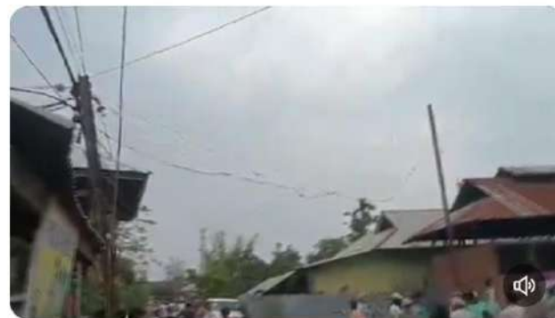
4:16 pm · 19 Apr 24 · 21.3K Views