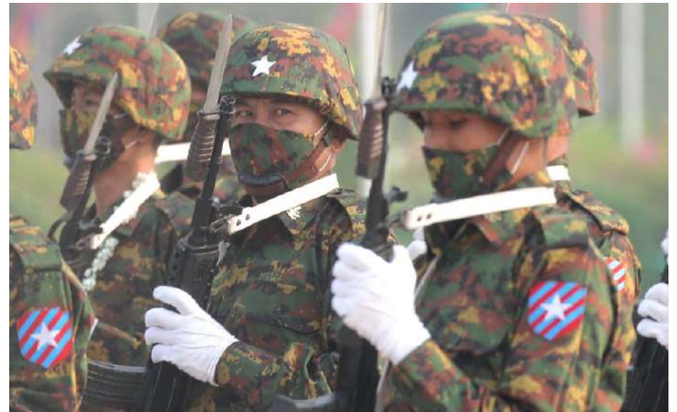
Pic: Representational image

The news report mentioned that the army faced "an allied resistance by PDFs of the Sagaing