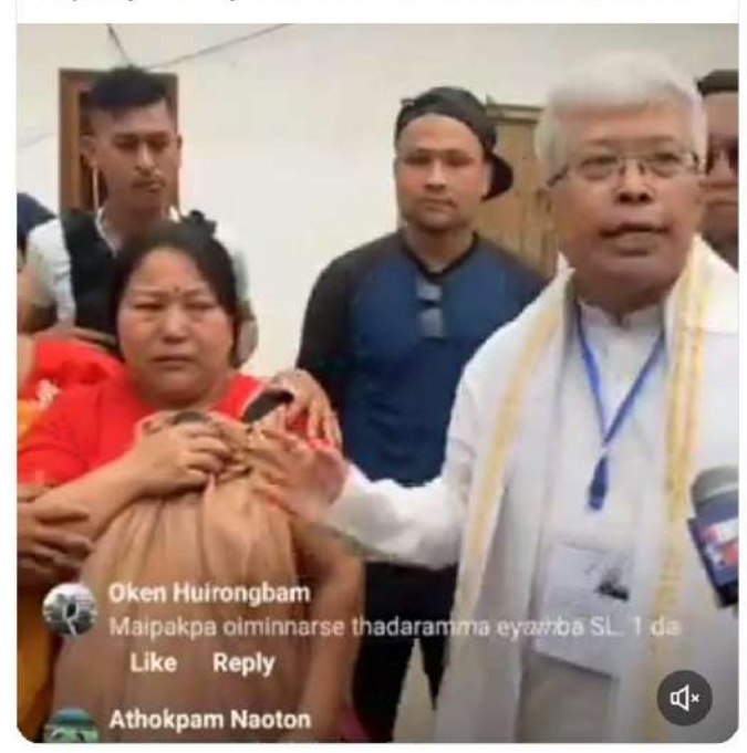
2:13 pm · 20 Apr 24 · 5,441 Views

Imphal yesterday how the armed men attack the voters