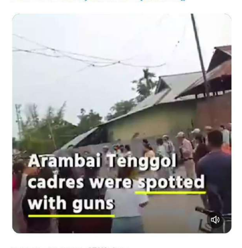
8:00 am · 20 Apr 24 · 272K Views

The Desperate Bigots will try everything.. But its YOU ...who can stop them .. its YOU .. who can bring the Change . Vote to #SaveDemocracySaveIndia #justasking