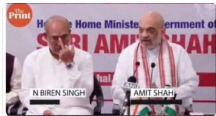
21:55 · 20 Jul 24 · 69 Views